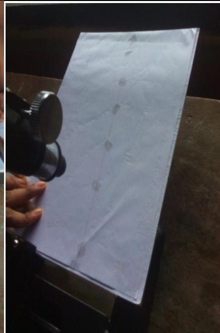
Determination of radius of muga silk