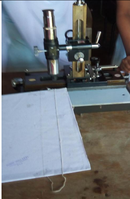
Determination of radius of Eri