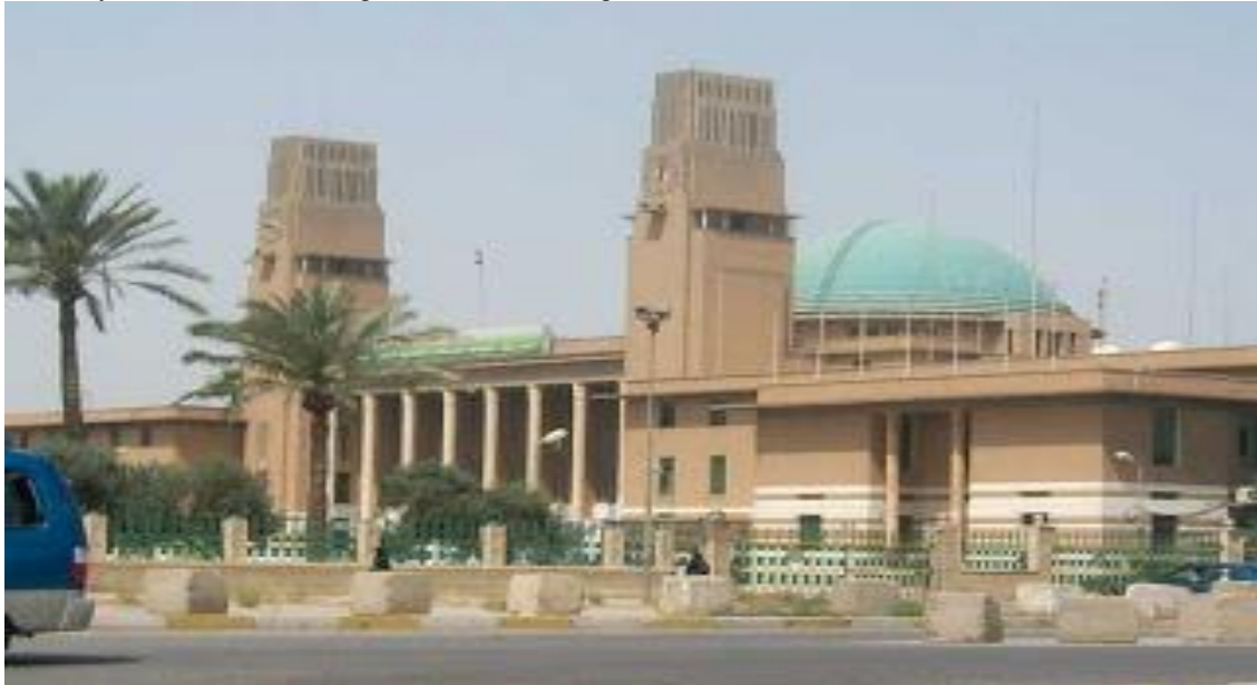
Figure 2: The Railway central station in Baghdad.

The Railway central station in Baghdad is shown in figure 2.