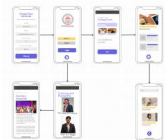
Figure 2: Overview