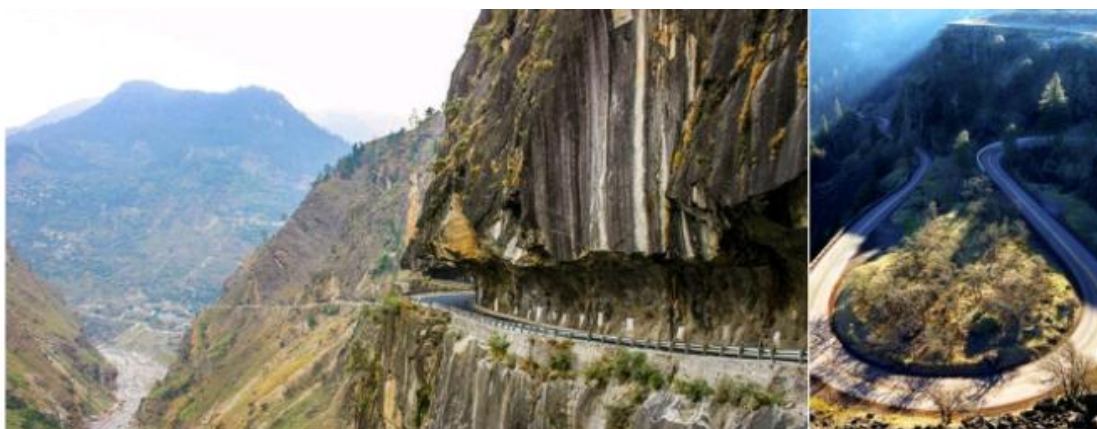
Fig 4 -View of the Curved path in Indian Highways