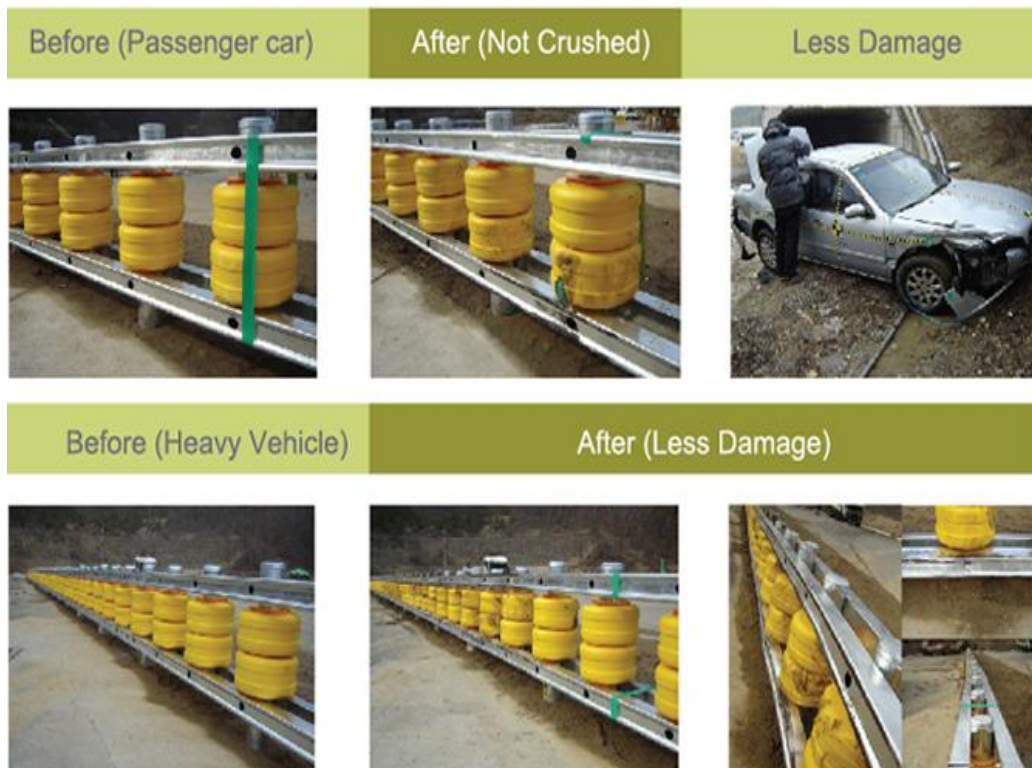
Fig 3 - Synthetic Result : Satisfied with Criteria