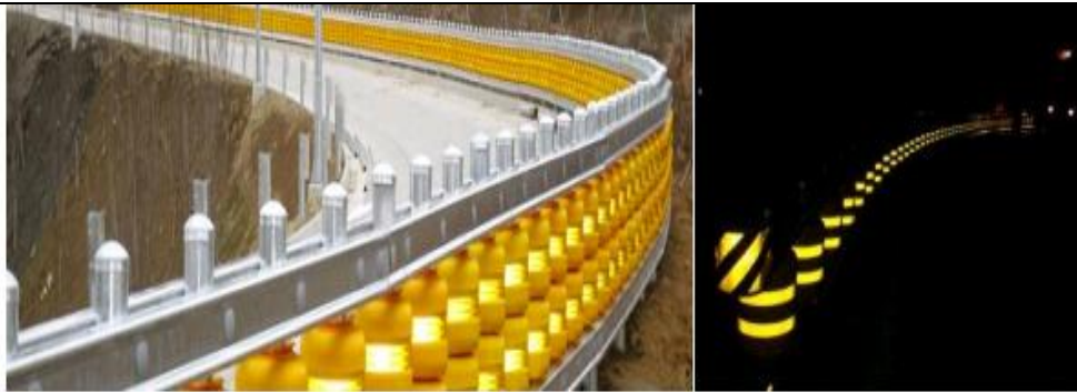
Fig 1 – Rolling Barriers